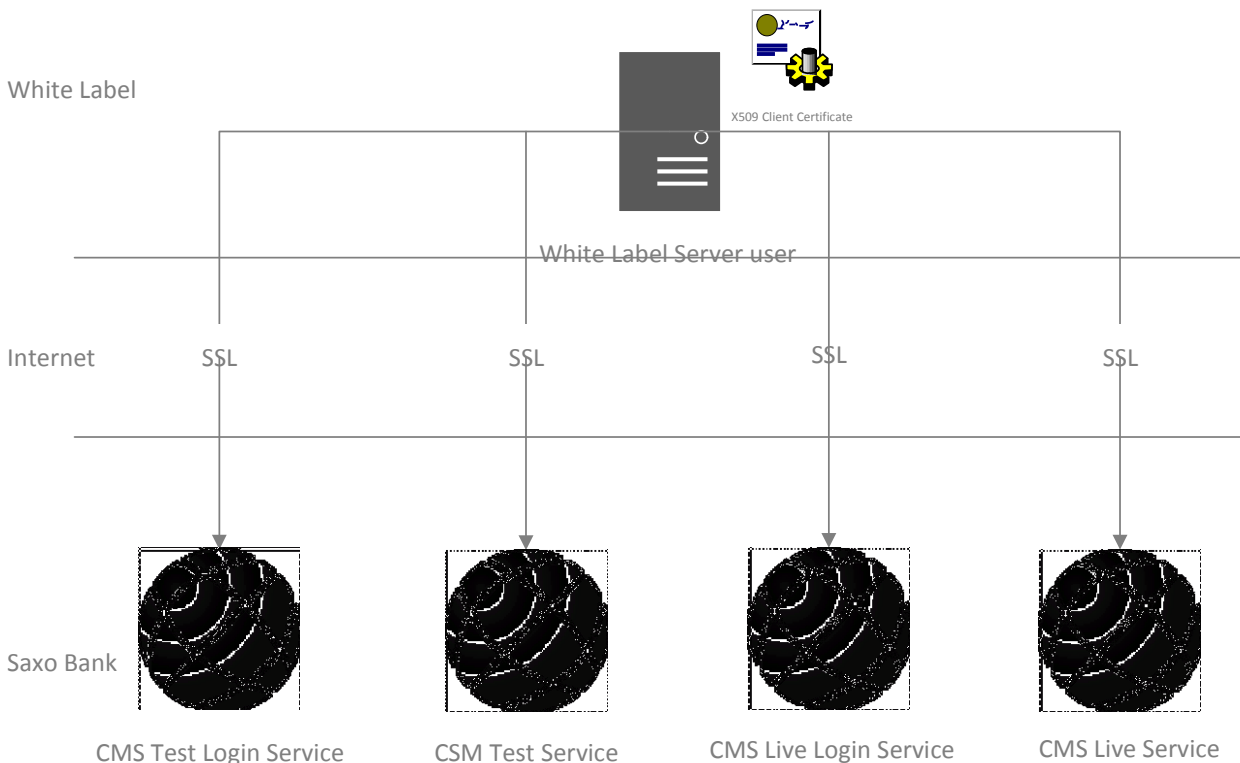
FIGURE 1 CMS API SERVICES

The CMS API is divided into two services where each is in a test and live version. These are CMS Test Login Service, CMS Test Service, CMS Live Login Service and CMS Live Service as illustrated below.